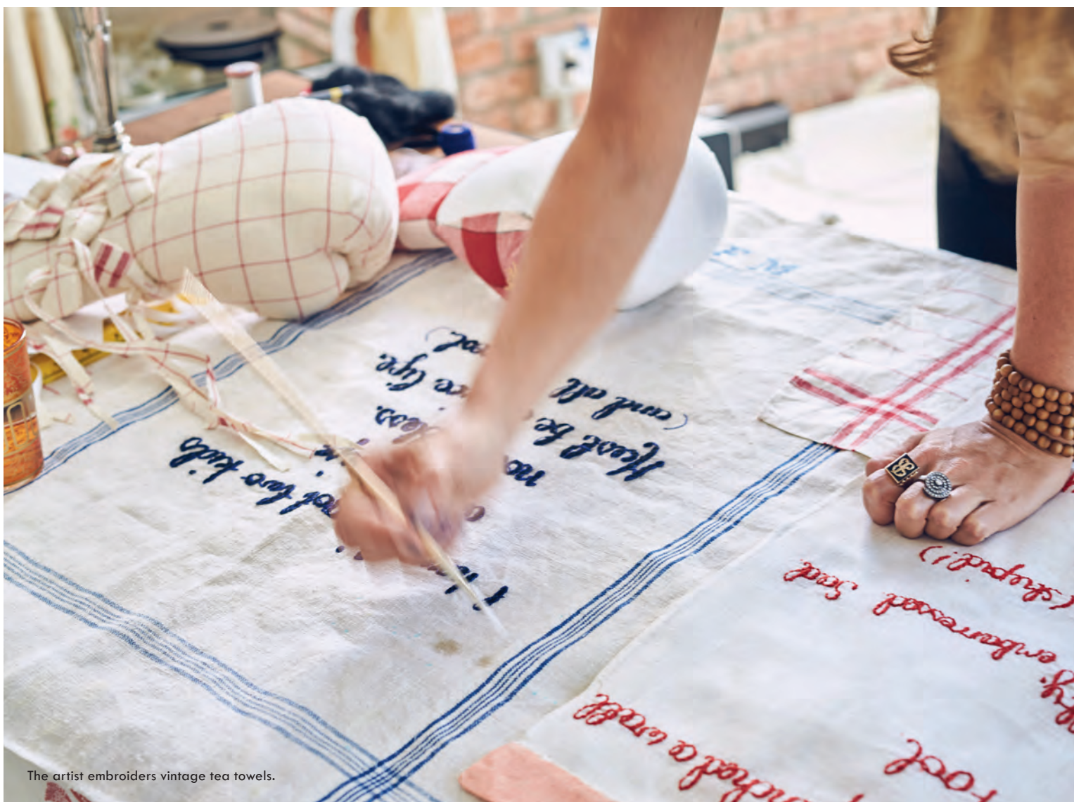
The artist embroiders vintage tea towels.