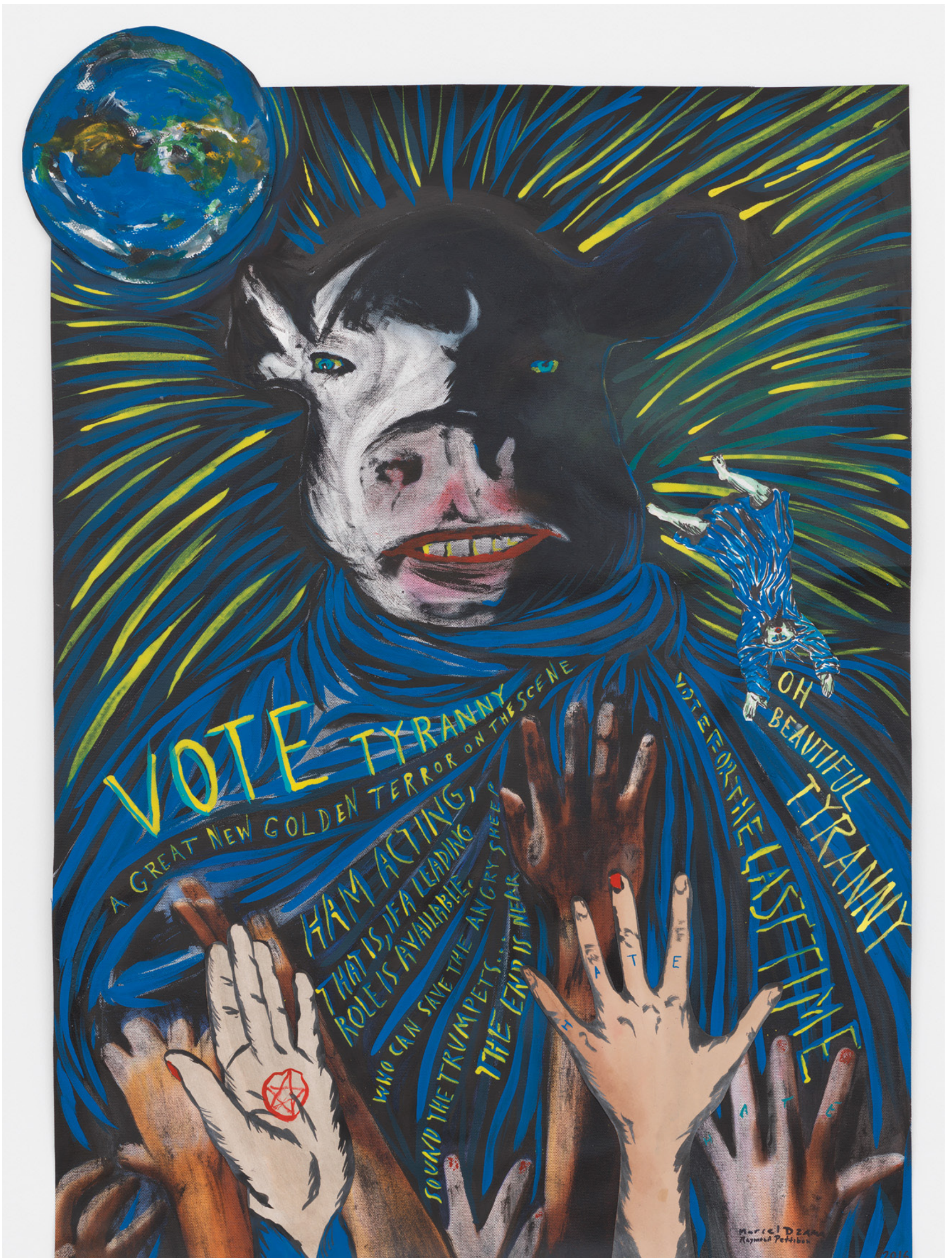
This message has been approved by Raymond Pettibon and Marcel Dzama and W magazine.